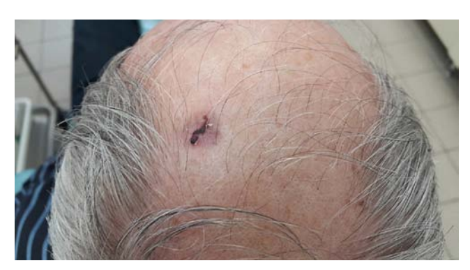
Figure 5. BCC focus on the cranial vault