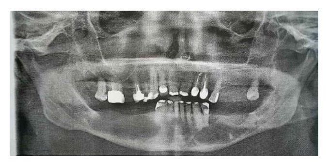
Figure 6. Panoramic radiograph – keratocyst on the left side and radicular cyst of the right side of the mandible

cystectomy under general anaesthesia was performed. The examination of the removed lesions confirmed the initial diagnosis.