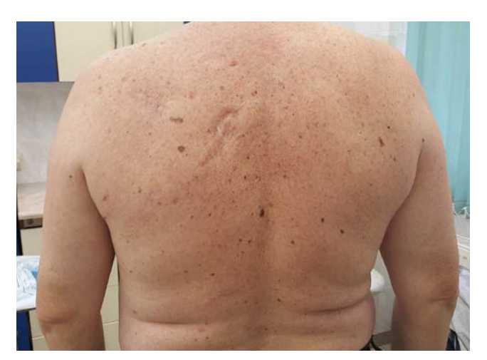
Figure 3. Numerous scars after the removal of basal cell carcinoma on the back