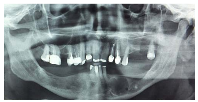
Figure 9. Panoramic X-ray recurrence of keratocyst on the left side and bone regeneration on the right side of the mandible