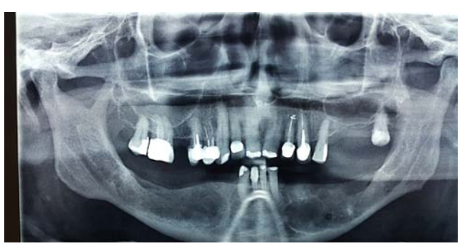
Figure 11. Control panoramic X-ray after removal of the left-sided KCOT recurrence, visible right-sided bone regeneration