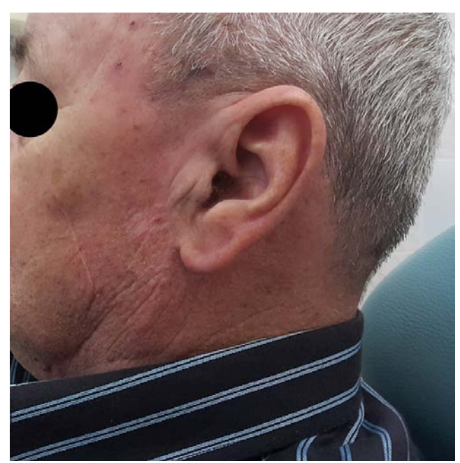
Figure 2. Condition after removing two foci of carcinoma in the left preauricular area

Panoramic radiograph (OPG) (Fig. 6) and computed tomography (CT) (Fig. 6,7) showed two oval areas of increased translucences that were well-differentiated with a marked osteosclerotic capsule. On the right, there is osteolytic defect from the 43 tooth at 44 mm and discontinuation of the bone lamella in the upper part of the mandibular alveolar process. On the left, there is the second area of mandible destruction from tooth 33 at 37 mm where the teeth 33 and 34 are in contact with the lesion. Discontinuation of the bone in the upper mandible is present.